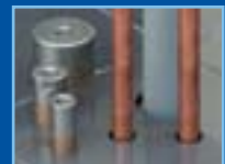
CLEAN & ACCURATE LARGE DIAMETER HOLES