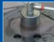
RAPID PENETRATION USING PILOT PIN & DIAMOND CROWN