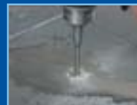
SMALL DIAMETER PTC DRILL USED FOR ACCURATE PILOT HOLE