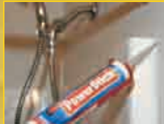
• Shower Stalls