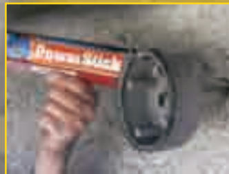
• Outdoor Fixtures