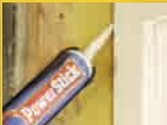
• Window Trim