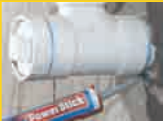
• PVC Plumbing