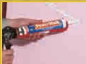
• Foam Insulation