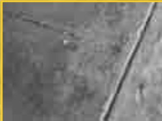
• Concrete Floor Joints