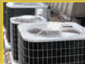
• Air Conditioning