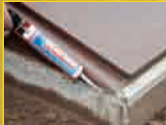
• Cellar Hatchways