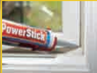
• Window Sills